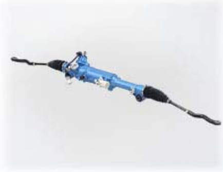
Dual pinion type EPS