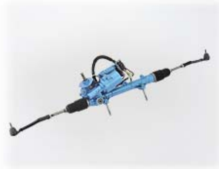
Pinion type EPS