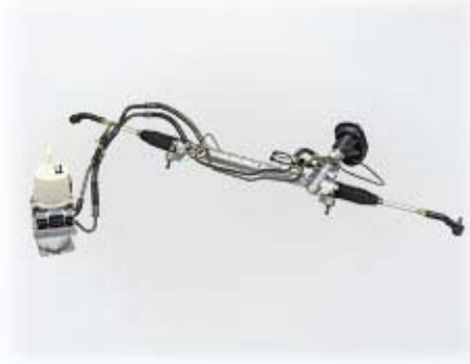
Rack direct drive type EPS

107. Electric Powered Steering Assemblies are installed by original equipment manufacturers (“OEMs”) in new cars as part of the automotive manufacturing process.