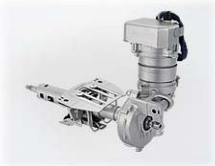
Column type EPS

106. Examples of Electric Powered Steering Assemblies manufactured by certain of the Defendants are shown below.